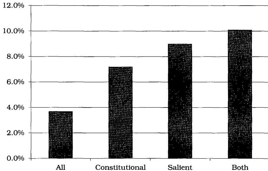
FIGURE 3. CITATION OF PIVOTAL CONCURRENCES BY LOWER COURTS, BY TYPE OF CASE

The empirical data are quite telling regarding the story we have told. The Supreme Court's "norm of acquiescence"—its attempt to function largely as a classic per curiam court—shattered in the face of substantial disagreements following the Progressive Era and into the New Deal. 243 This happened in salient, constitutional cases because that is where the battle was being fought: over the meaning and constraints of the Constitution. And in those cases, the seriatim practice of writing separate opinions signaled, invited, and smoothed the process of constitutional change.